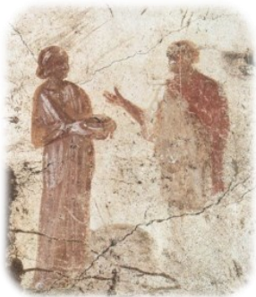
Fresco, c. 225 AD Catacombs of Praetextatus, Rome