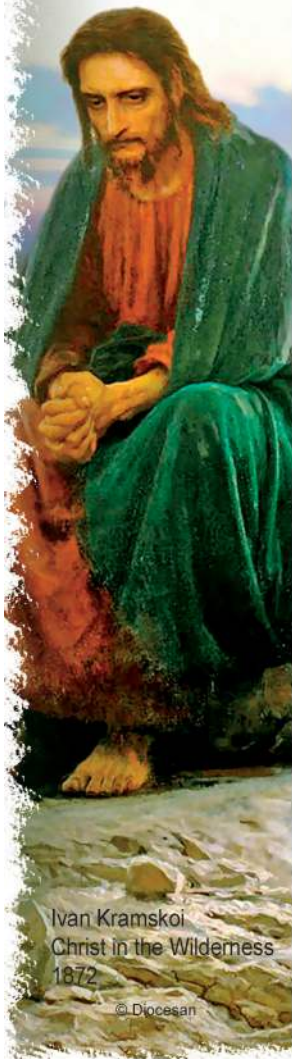
Ivan Kramskoi Christ in the Wilderness 1872

*For all Sacraments, please call the parish office.