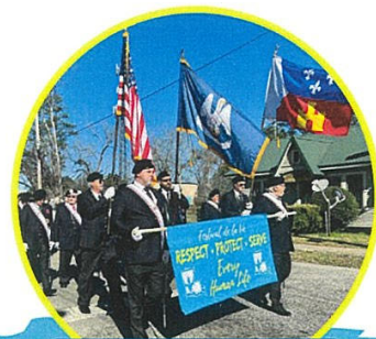
Interfaith Prayer Walk, Praise Music, Fun & Food