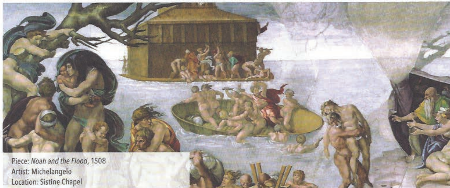
Piece: Noah and the Flood , 1508

What important lessons have I learned from a challenge in my life? Maybe I can share that lesson with a friend or family member.