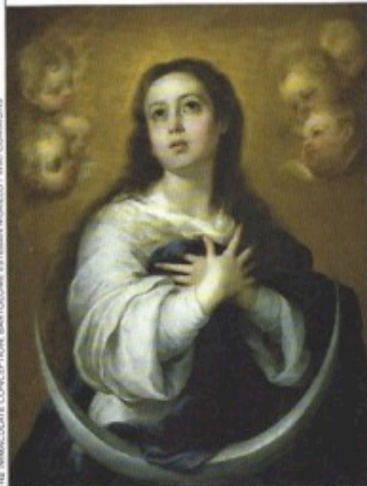
THE IMMACULATE CONCEPTION: BARTOLOME ESTEBAN MURILLO