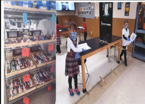
Teaching C+STEM Challenges amidst Covid Challenges

You should have received the new schedule for December and the Holiday Masses.