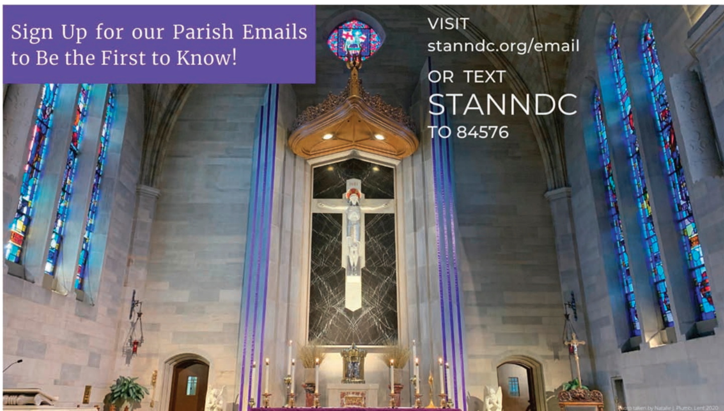
Lent 2020