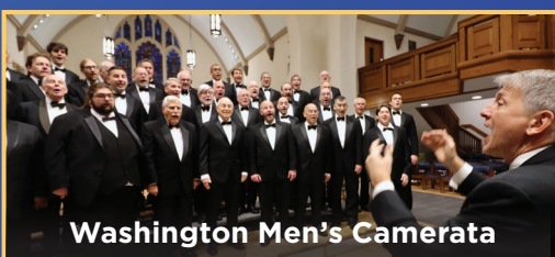
Washington Men's Camerata