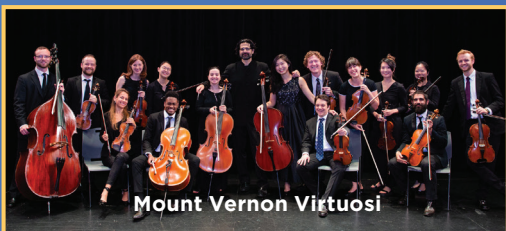
Mount Vernon Virtuosi