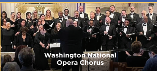
Washington National Opera Chorus