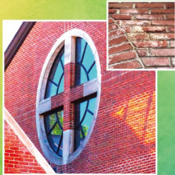
Brick work est. cost: $50k