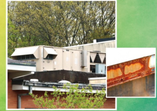
MULTIPLE HVAC UNITS est. cost: $200k