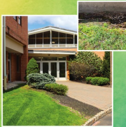
Landscaping and signage est. cost: $55k