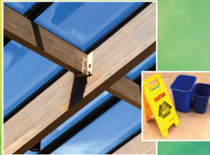
ATRIUM WINDOWS SEALS est. cost: $50-100k