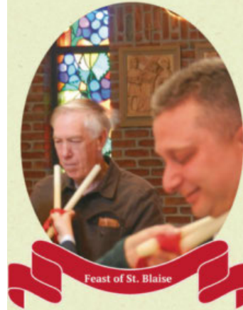
Feast of St. Blaise