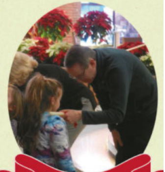
Feast of St. Blaise

Please remain at the end of Mass to receive this special blessing.