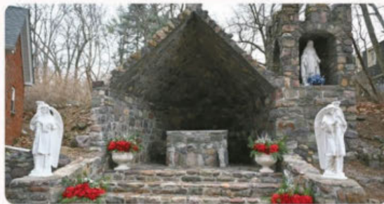
St. Bernard, Wharton