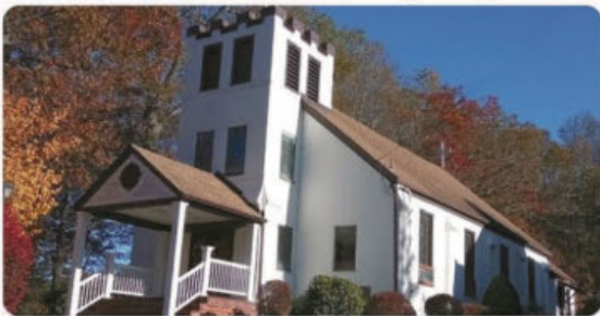
St. James, Montague