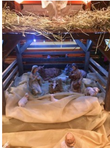
Christmas Eve at Annunciation

Let all that is within you praise His holy name!