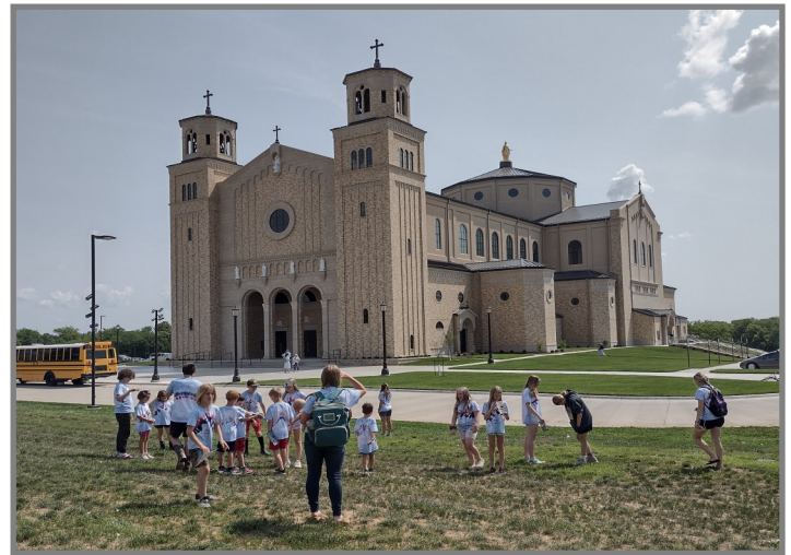
Immaculata at St. Mary's.

On the last day of VBS, a field trip was taken to the brand new Immaculata Church in St. Mary's, and to the old historic church, St. Joseph, in Topeka. It was a great trip and the kids enjoyed seeing the beauty of these Catholic churches. So much beauty to appreciate! A great way to end a beautiful week with the kids. Thanks again to everyone who helped make this week a huge success! We are very blessed!