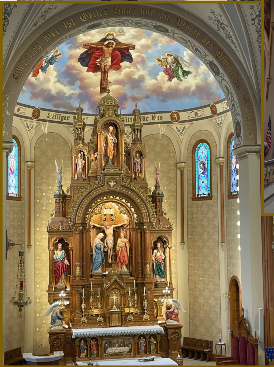
St. Joseph in Topeka.