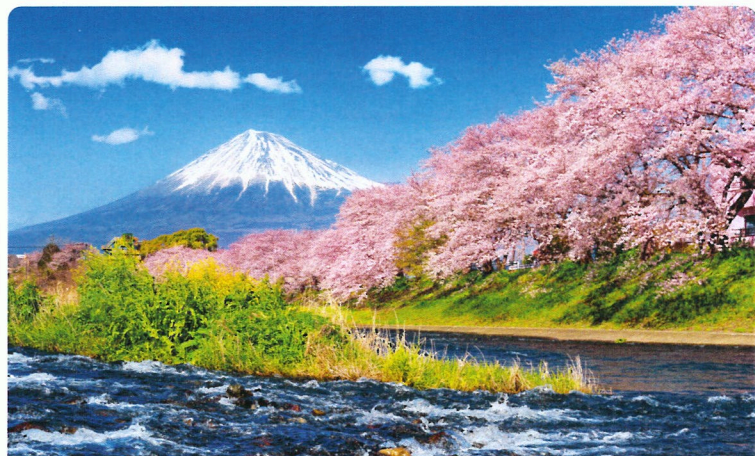
Fuji mountains and cherry blossom