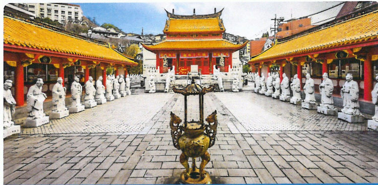
Confucius Shrine in Nagasaki