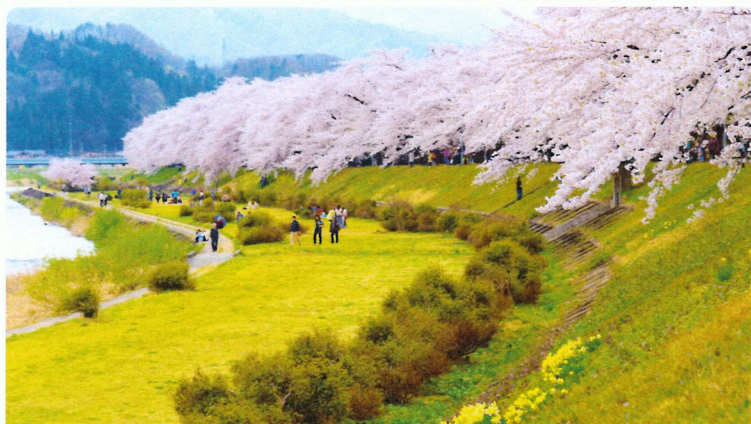
Akita, Samurai District

Mass at Osaka Takamatsu St. Mary Cathedral