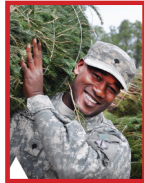
TREES FOR TROOPS