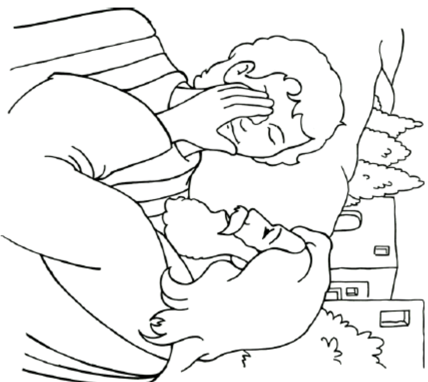
Jesus heals a blind man. John 9