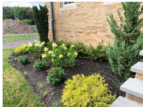
All thanks to the care and attention of John E. Driscoll Landscaping and the funding by a generous donor last fall.