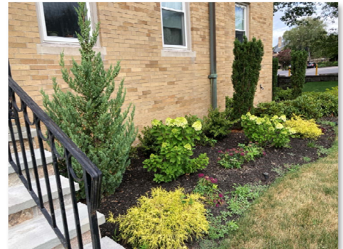
The fresh plantings are thriving in front of the rectory these days.

We are always looking for ideas and more members. Please complete our survey on our website (found under Ministries or click here ). Thank You!