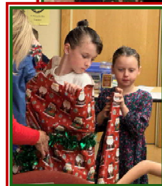
Christmas Wrap Relay! Families got into the Christmas spirit at the last BELIEVE Family Night when they were tasked with wrapping up a child in their group in just 5 minutes!