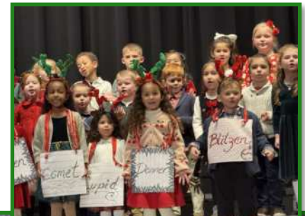
Santa's "reindeer", took part in this year's Christmas Concert.