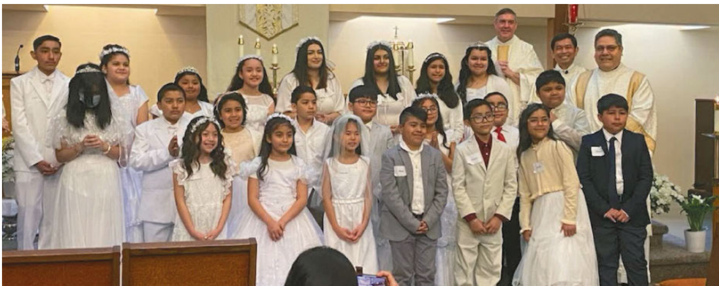
55 Families rejoiced this Past Saturday April the 30th as they celebrated their Children First Communion. Please keep these children in your prayers and their families so that the Lord will continue to nourish them and strengthen them in their faith.