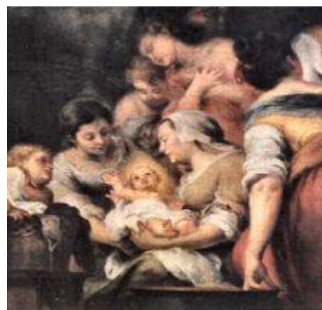
Mary as a baby. The Birth of the Virgin Mary - Esteban Murillo ( Louvre, Paris )

The Angel of the Lord declared to Mary: And she conceived of the Holy Spirit.