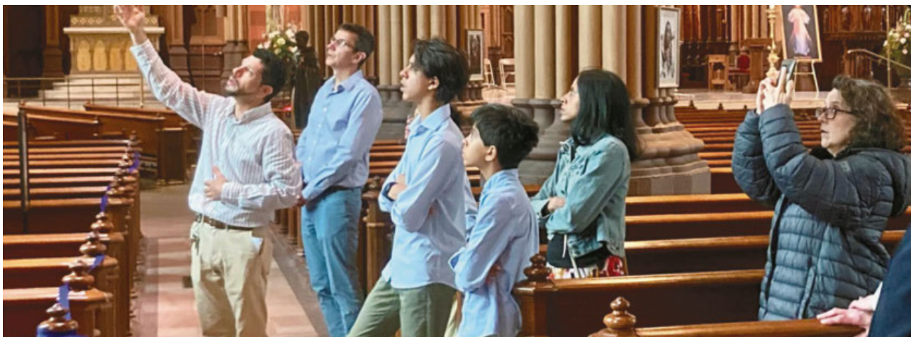
Some of the Cathedral tour group learning about the Stations of the Cross and stained glass windows.