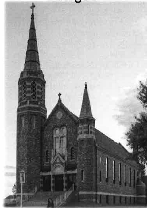
St. Michael Rural Linton