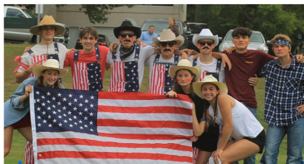
SJV KC Seminarians