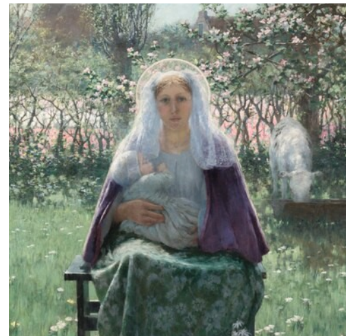
ART: “THE BLESSED MOTHER” BY GEORGE HITCHCOCK

If you suspect abuse or if a person is in imminent danger, always call 911 first. To report abuse to the archdiocese, visit: https://www.archspm.org/ .