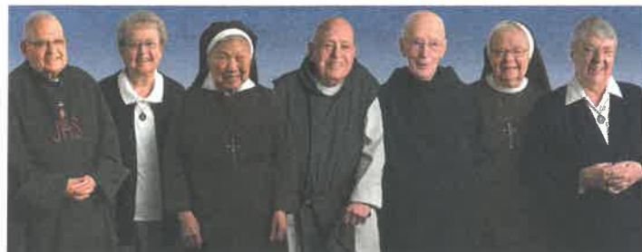
Meet them at retiredreligious.org/2018photos .

Almost 94 percent of donations directly aid senior religious.