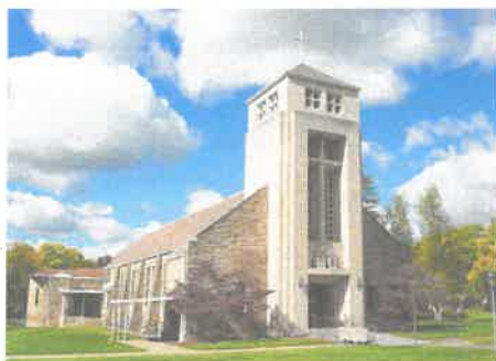
HOLY TRINITY CHURCH