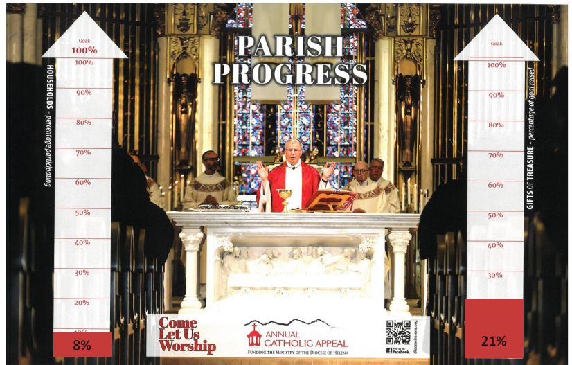
St. Ann's Parish Progress for the 2021 Annual Catholic Appeal.