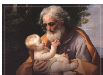
SAINT JOSEPH SPOUSE OF THE BLESSED VIRGIN MARY