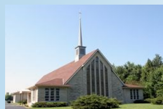
ST. MARY Catholic Church

Congratulations on the newest member of your family! Parents wishing to have their child baptized are asked to contact the Parish Office to make an appointment for pre-baptismal instruction.