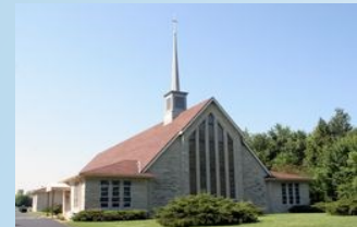
ST. MARY Catholic Church

Congratulations on the newest member of your family! Parents wishing to have their child baptized are asked to contact the Parish Office to make an appointment for pre-baptismal instruction.