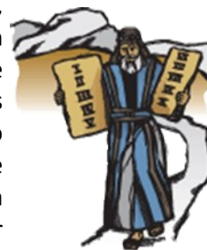
Moses Receives the Ten Commandments

On this Third Sunday of Lent, we hear God deliver the Ten Commandments to Moses and the Chosen People. The commandments provide a way for them to live up to their part of the covenant. We face the same challenge today. Lent is a wonderful opportunity to examine our consciences and recall times when we have failed to follow one of God's commands and determine which one of the commandments we find difficult to obey consistently.