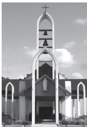
ST. PETER CATHOLIC CHURCH