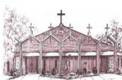
ST. HUBERT CATHOLIC CHURCH

Adoration @ St Hubert ..... 3rd Thursday of the Month 3:00 pm—7:00 pm