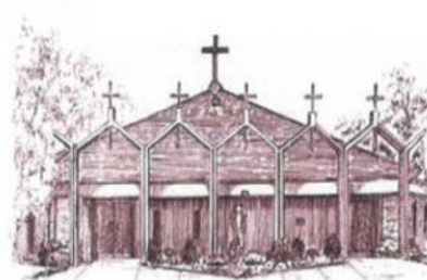
ST. HUBERT CATHOLIC CHURCH

Adoration @ St Hubert ..... 3rd Thursday of the Month 3:00 pm—7:00 pm