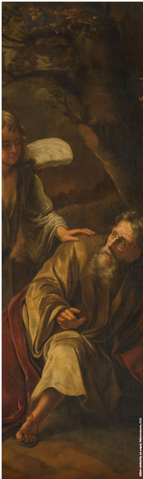
Elijah visited by an angel

This week bring this person some food or drink. Say a prayer for and with them. You'll be a messenger of God's redeeming love, offering nourishment for the spirit and soul as well as the body.