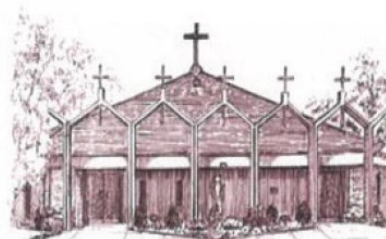
ST. HUBERT CATHOLIC CHURCH

Adoration @ St Hubert ..... 3rd Thursday of the Month 3:00 pm—7:00 pm