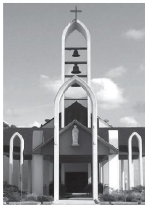
ST. PETER CATHOLIC CHURCH