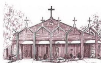
ST. HUBERT CATHOLIC CHURCH

Adoration @ St Hubert ..... 3rd Thursday of the Month 3:00 pm—7:00 pm