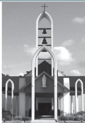
ST. PETER CATHOLIC CHURCH