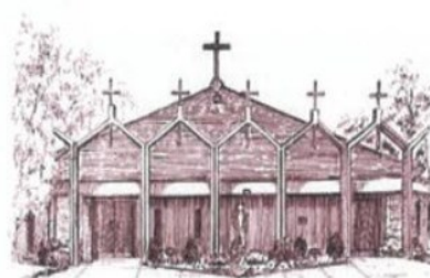
ST. HUBERT CATHOLIC CHURCH

1st Friday of the Month @ St. Hubert - following mass 8:00 am—Holy Hour with Exposition and Benediction Adoration @ St. Hubert ..... 3rd Thursday of the Month 4:00 pm—6:00 pm