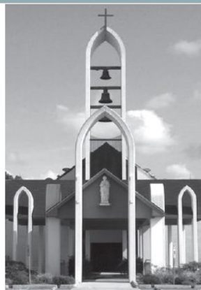
ST. PETER CATHOLIC CHURCH