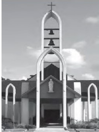
ST. PETER CATHOLIC CHURCH