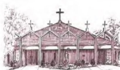
ST. HUBERT CATHOLIC CHURCH

Adoration @ St Hubert ..... 3rd Thursday of the Month 4:00 pm—6:00 pm