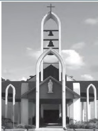
ST. PETER CATHOLIC CHURCH