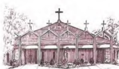
ST. HUBERT CATHOLIC CHURCH

Adoration @ St. Hubert ..... 3rd Thursday of the Month 4:00 pm—6:00 pm