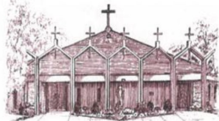
ST. HUBERT CATHOLIC CHURCH 176 ANTHONY F. MONICA STREET GARYVILLE, LA 70051

Adoration @ St Hubert ... 3rd Thursday of the Month 4:00—6:00 pm