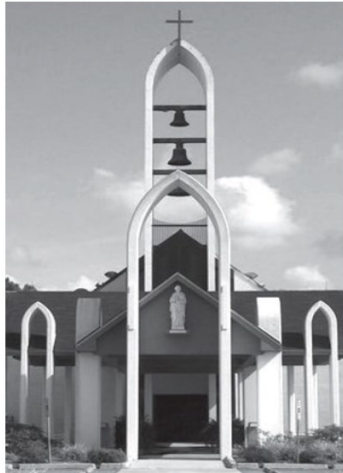
ST. PETER CATHOLIC CHURCH 1550 HWY 44 RESERVE, LA 70084