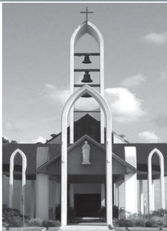
ST. PETER CATHOLIC CHURCH