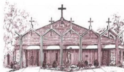
ST. HUBERT CATHOLIC CHURCH

Adoration @ St Hubert ... 3rd Thursday of the Month 4:00—6:00 pm