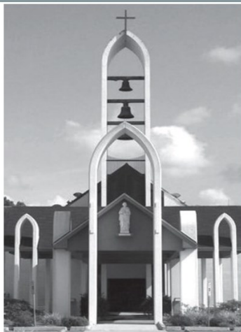
ST. PETER CATHOLIC CHURCH