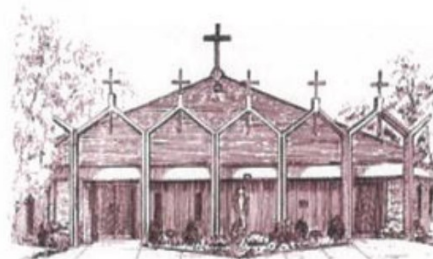
ST. HUBERT CATHOLIC CHURCH

Adoration @ St Hubert ... 3rd Thursday of the Month 4:00—6:00 pm