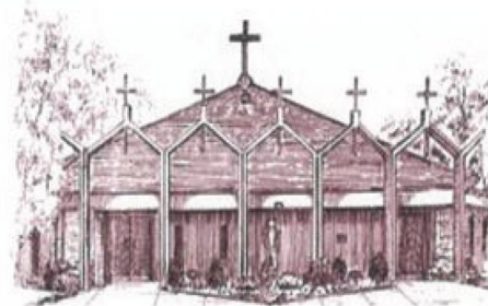
ST. HUBERT CATHOLIC CHURCH 176 ANTHONY F. MONICA STREET GARYVILLE, LA 70051

Rosary Armada 25th of the month @ St. Hubert Church