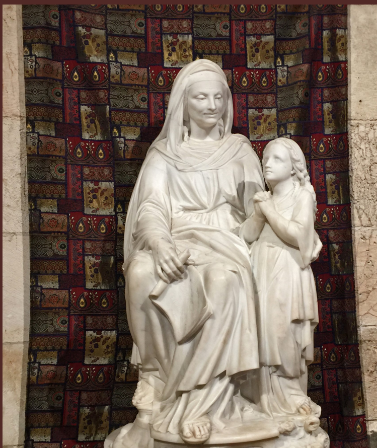
Photo of St. Ann and Mary Statue from a church in Jerusalem

SAINT LOUIS-MARIE GRIGNION DE MONTFORT: 1673-1716