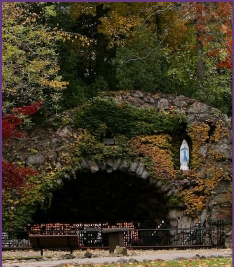
Our Lady of Lourdes Grotto at Notre Dame

Our warmest welcome to all who worship with our parish family, whether long-time resident or new visitor to our parish. If you are interested in registering at St. Louis de Montfort Catholic Church, you may do so on our website ( www.sldmfishers.org ) or at the parish office.