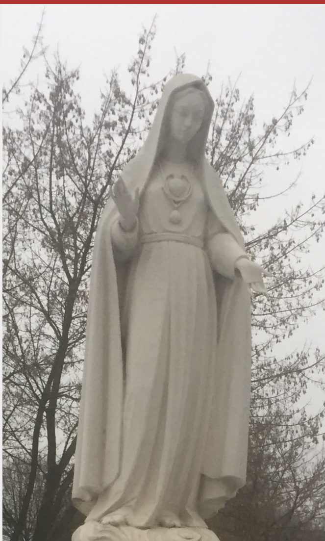
Statue at the Holy Trinity Catholic Church in Riga, Latvia.

Our warmest welcome to all who worship with our parish family, whether long-time resident or new visitor to our parish. If you are interested in registering at St. Louis de Montfort Catholic Church, you may do so on our website ( www.sldmfishers.org ) or at the parish office.