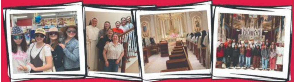
FUN AND COMMUNITY BUILDING