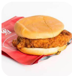
SPICY CHICKEN SANDWICH

PLEASE CLICK ABOVE TO ORDER DUE THURSDAY APRIL 27, 2023