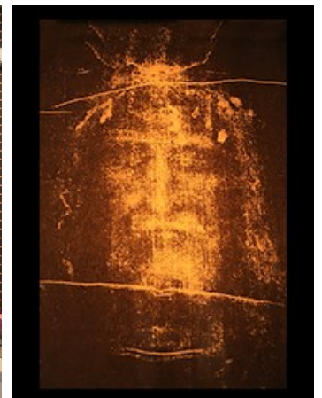
...Seek my face.. 2 Chronicles 7:14